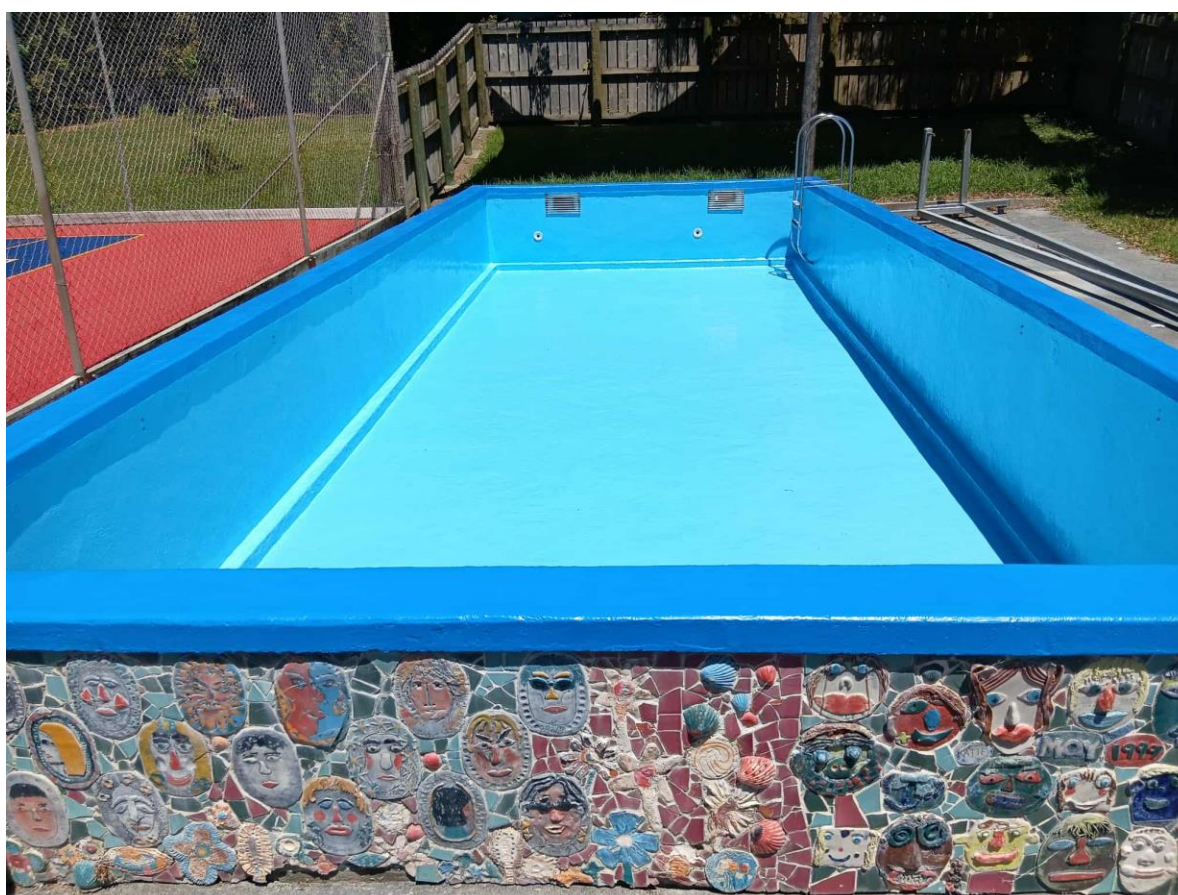
The pool's new paint job is complete! Ready for Summer swimming