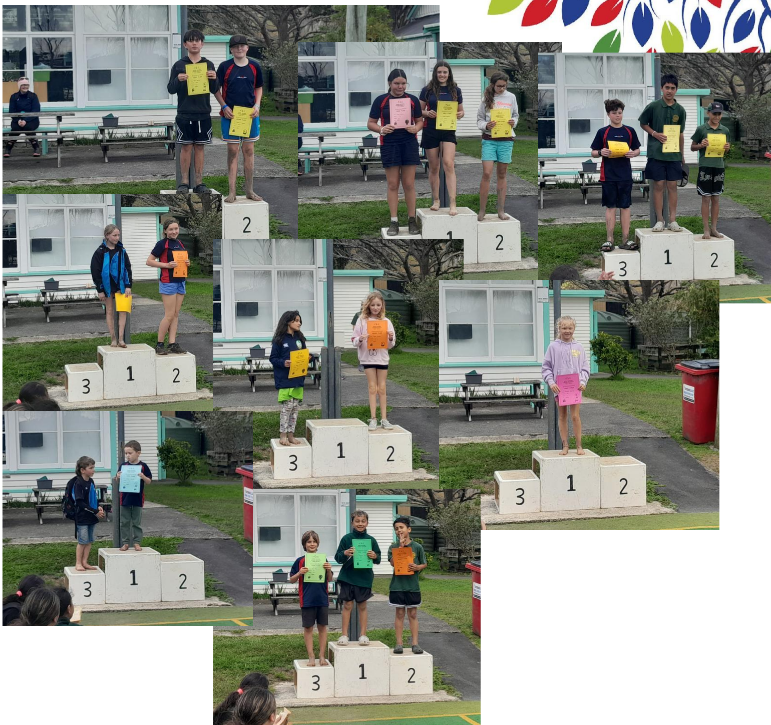
Tomarata Students on the podium at Tuesday's Rodney Rural Schools Cross Country.