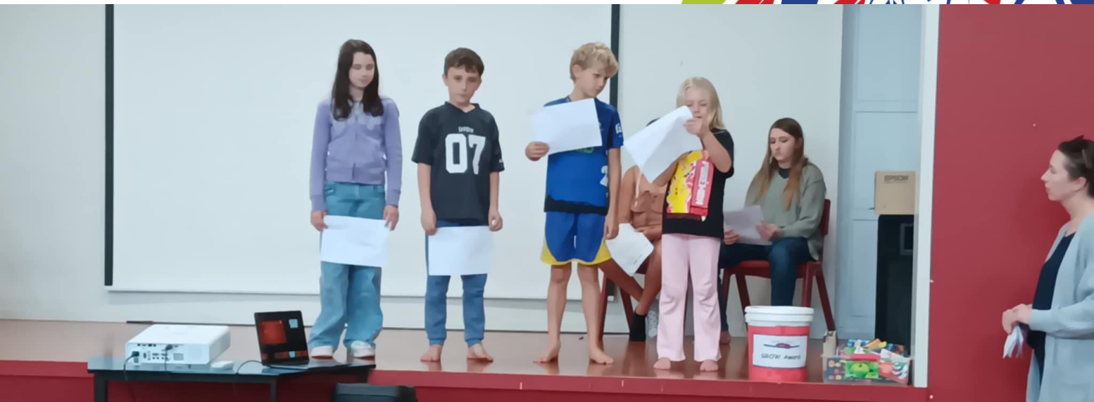
Room 6 Sharing their writing