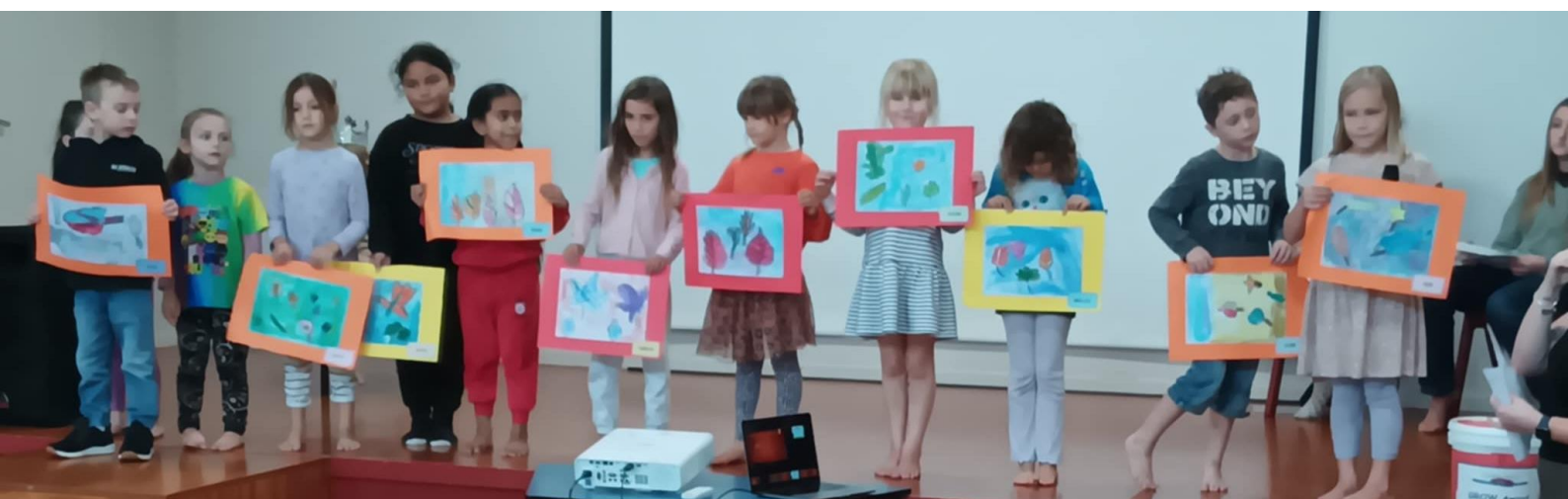
Room 5 Autumn Art