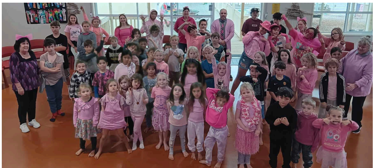
Pink Shirt Day 2024. What an outstanding effort Tomarata School.