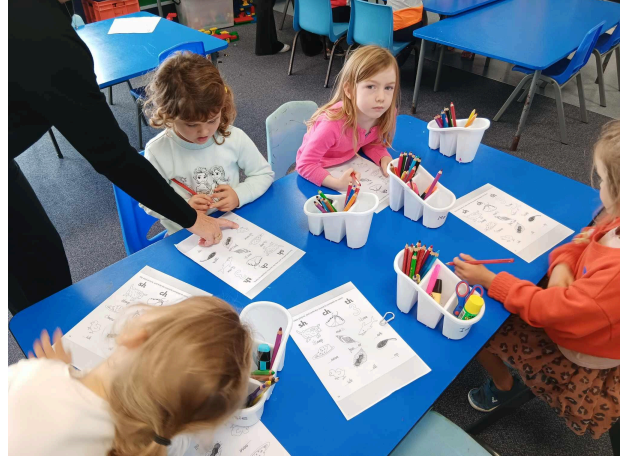
Room 1 students engaged and learning their letter sounds.