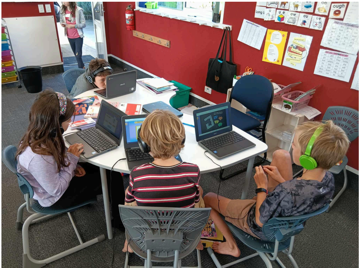
Room 5 students using Reading Eggs to support their literacy learning.