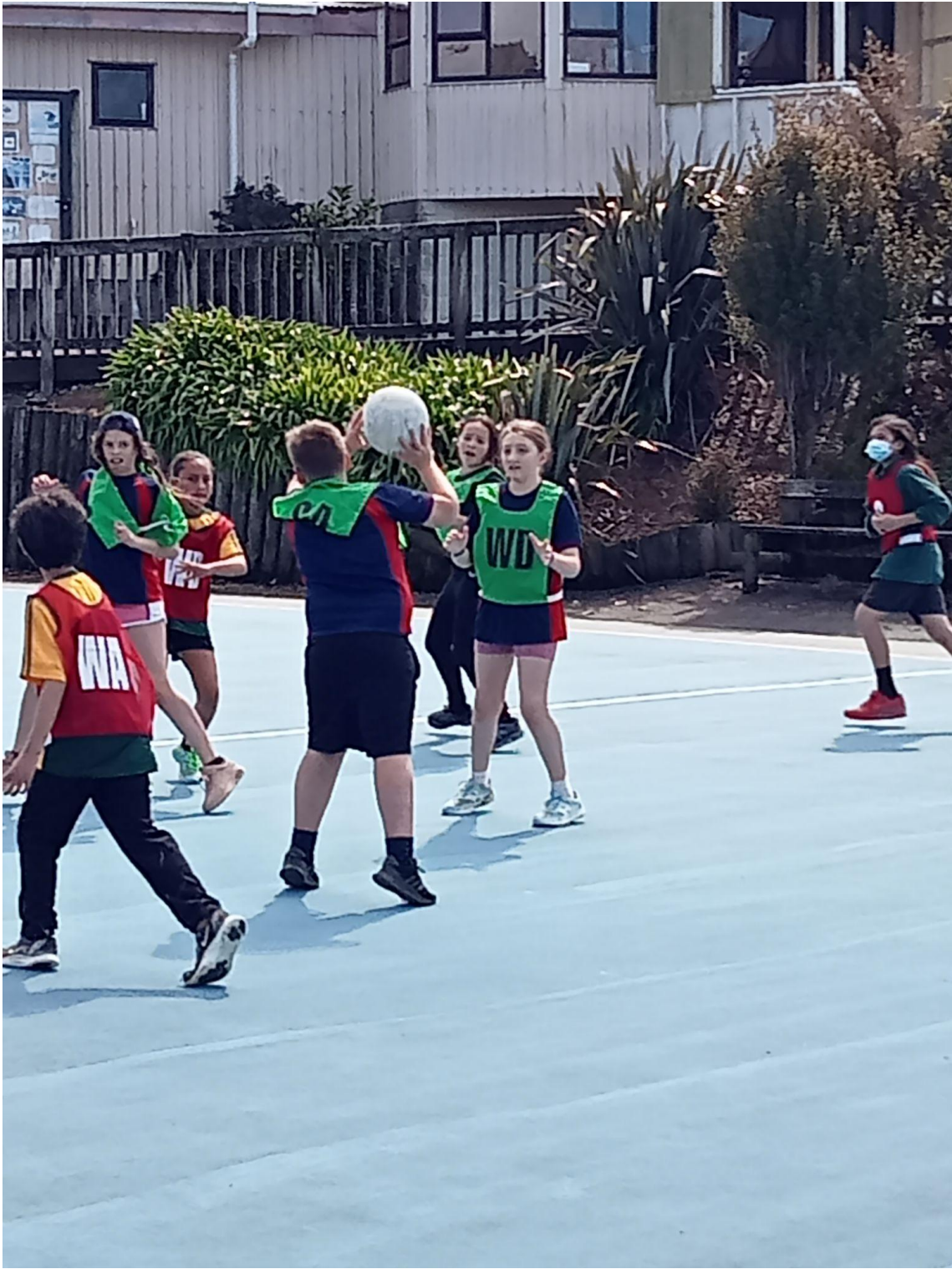
Netball/Hockey at Centennial Park.