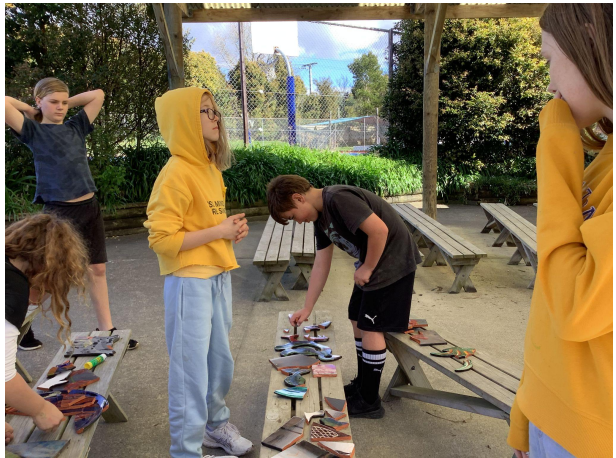
Room 7 students working on their legacy garden project.