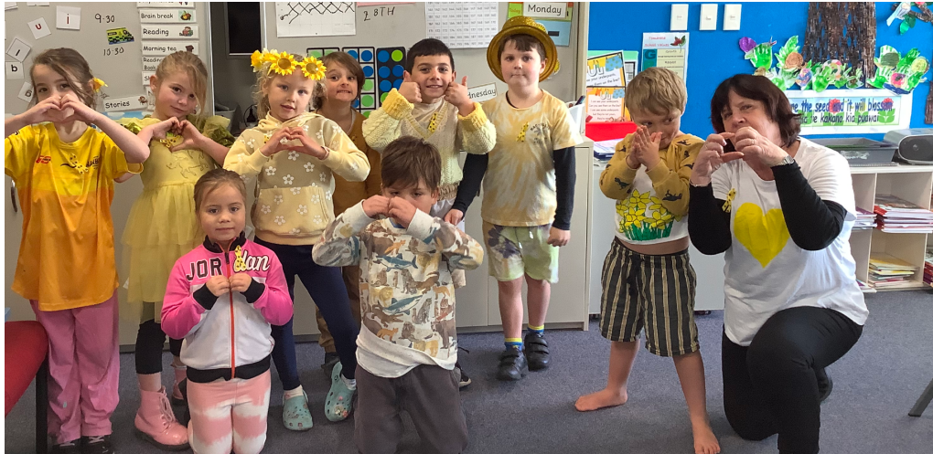
Room 1 showing aroha, and giving generously on Daffodil Day.