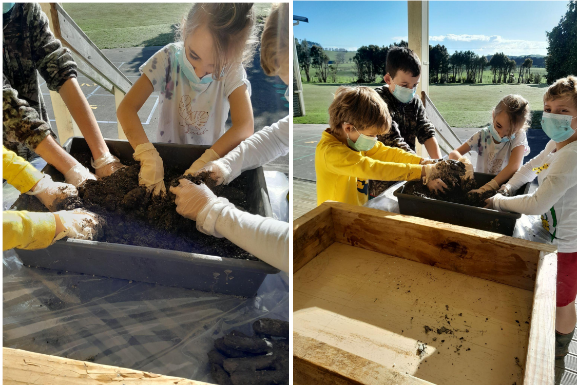
Room 5 students rolling their sleeves up and getting busy making hypertufa.