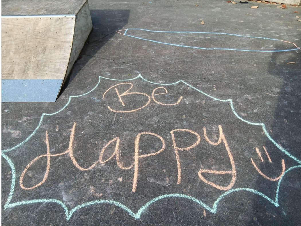
Students made the most of the sun and got creative with the coloured chalk...