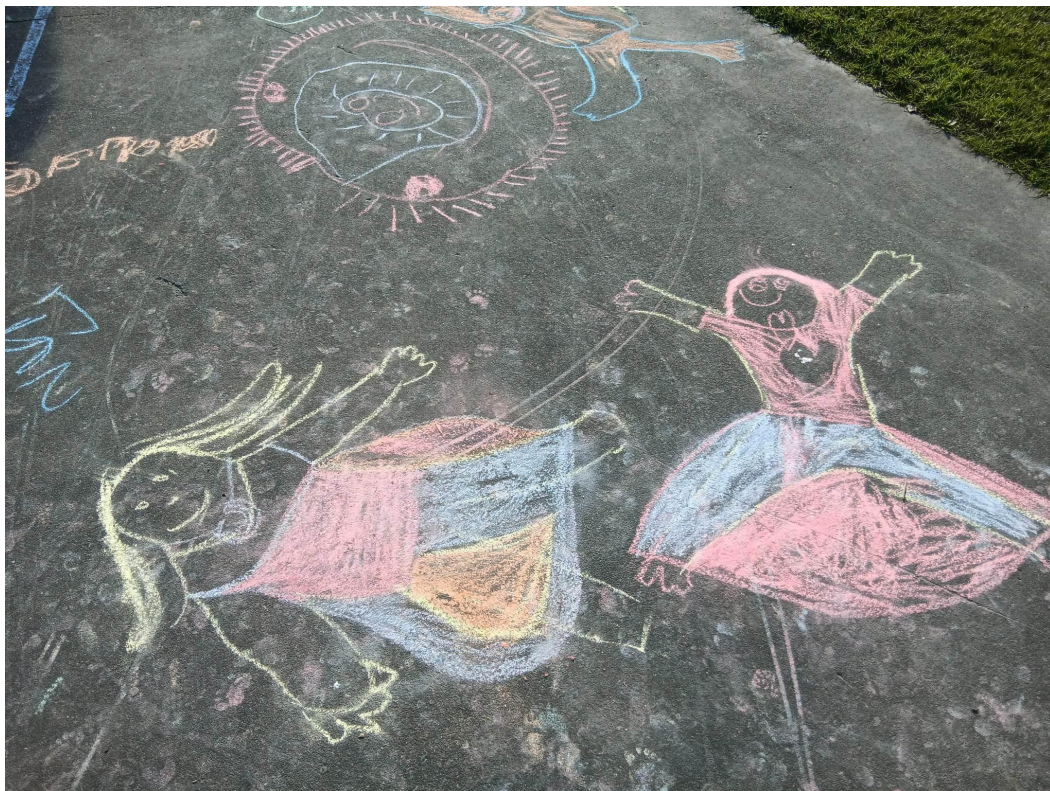
Looking good Room 1.