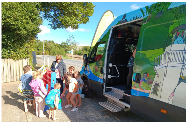
Auckland Libraries Mobile Library visit.