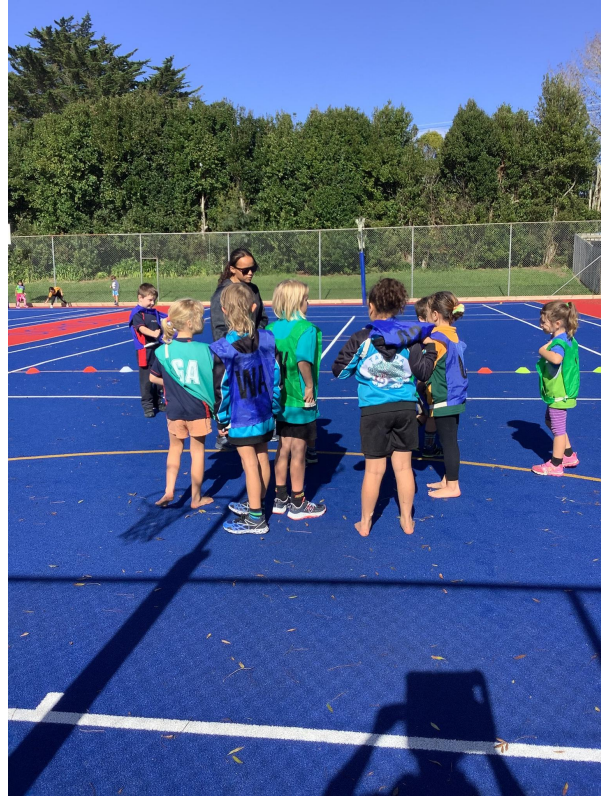
Highlights from Tuesday's Tabloid Sports.