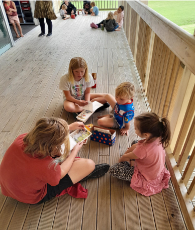
Room 7 and 1, Buddy reading