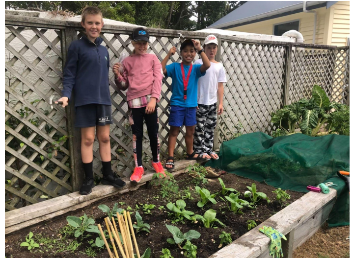
Table programme. We could not do it without your continuing support.