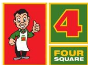
Top Shop 4 Square Wellsford